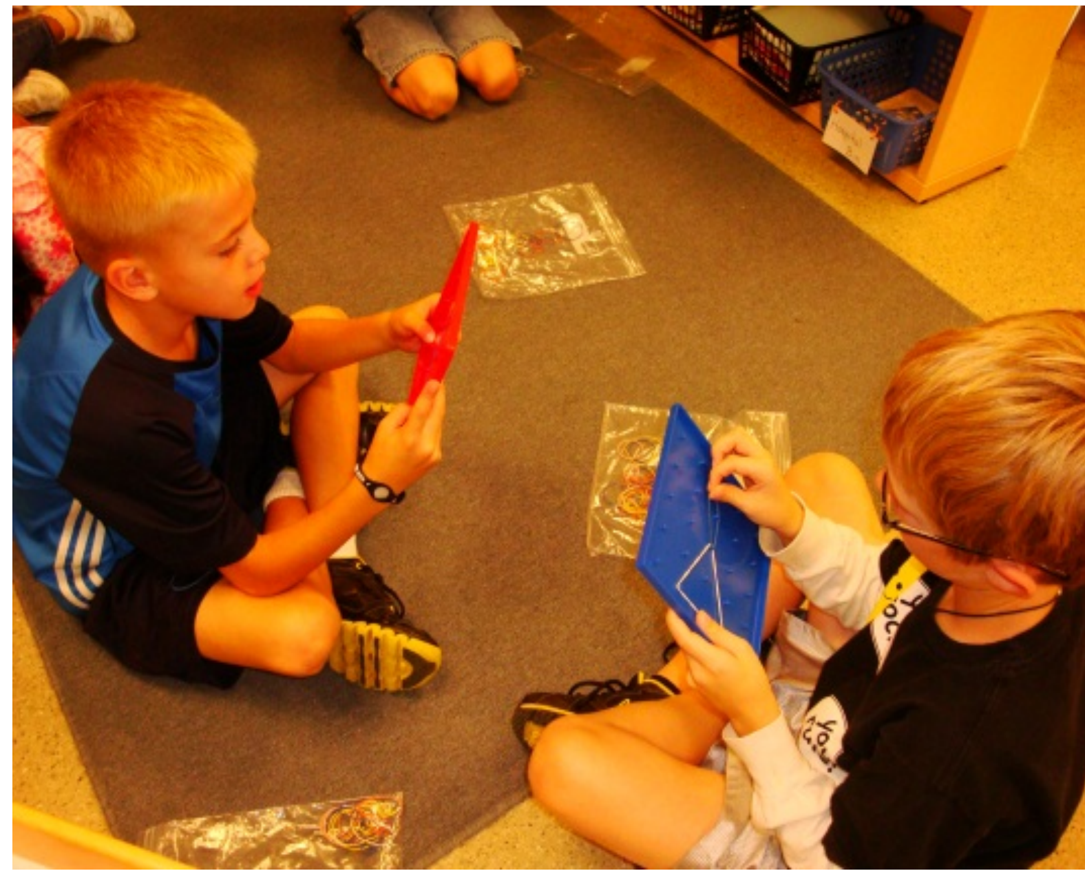
Two second graders enjoy exploring geoboards during math stations.