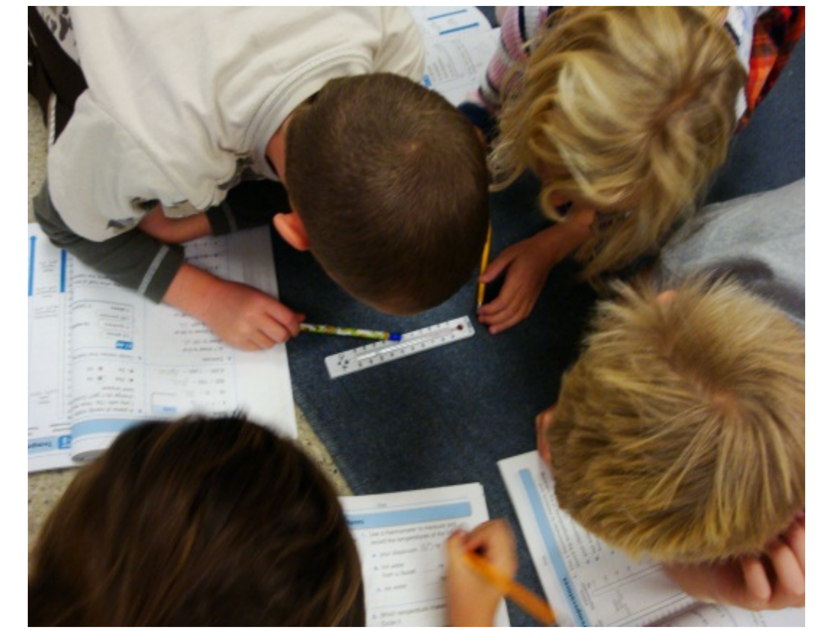
Students are engaged as they participate in an activity involving thermometers.