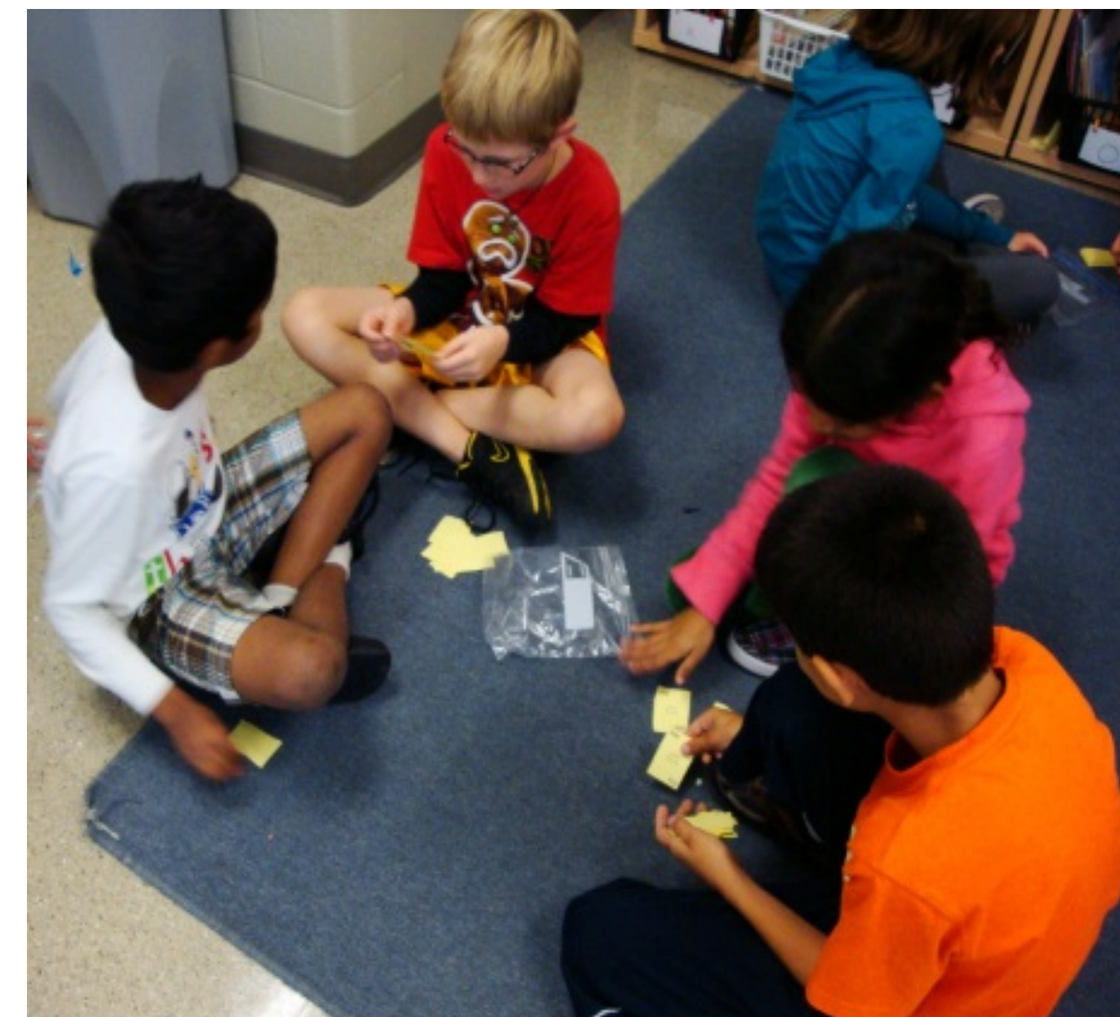
A small group plays Dollar Rummy, a math game that involves counting money.