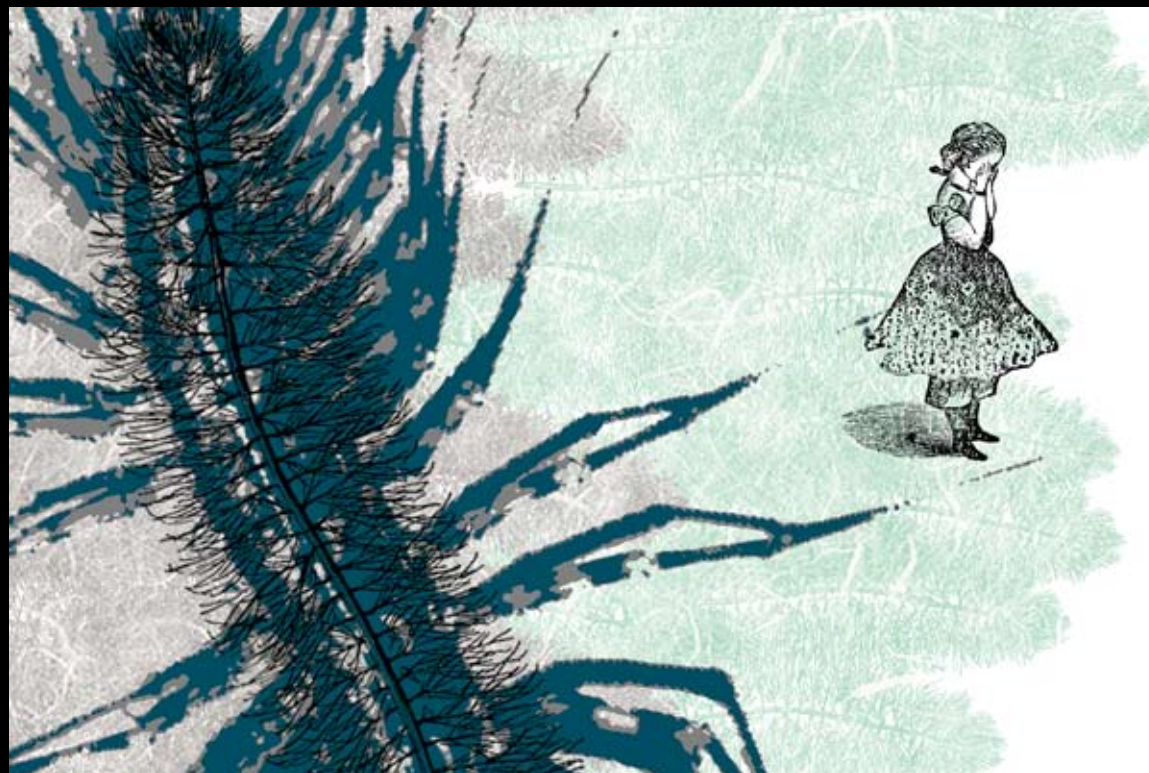
"I AM NOT AFRAID" digital print 2009

217 840-4494 lkczys@gmail.com www.iwu.edu/~lkczys/portfolio/