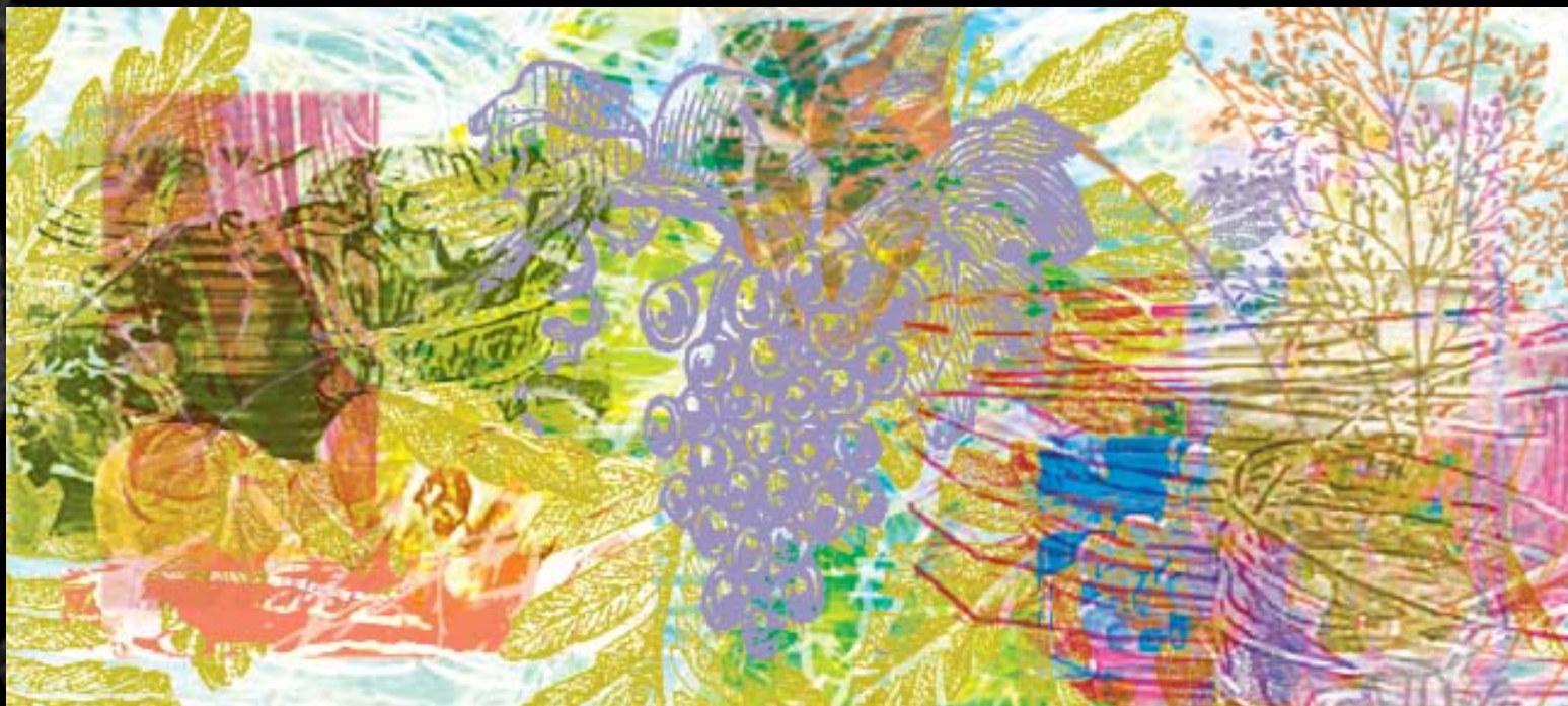
"UNTAMED" digital print 2009

217 840-4494 lkczys@gmail.com www.iwu.edu/~lczyz/portfolio/