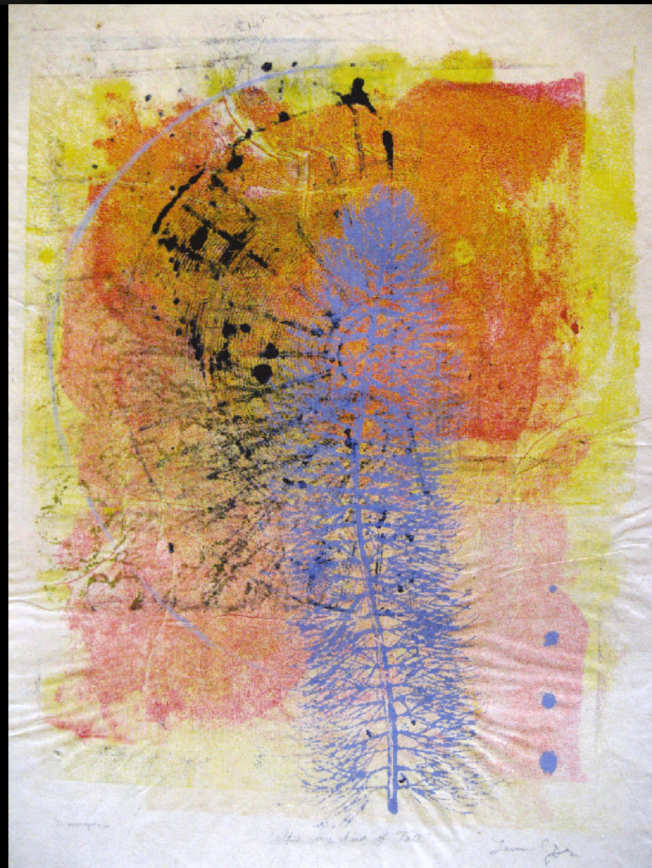
"MY KIND OF FALL" monoprint 2009

217 840-4494 lkcys@gmail.com www.iwu.edu/~lczys/portfolio/