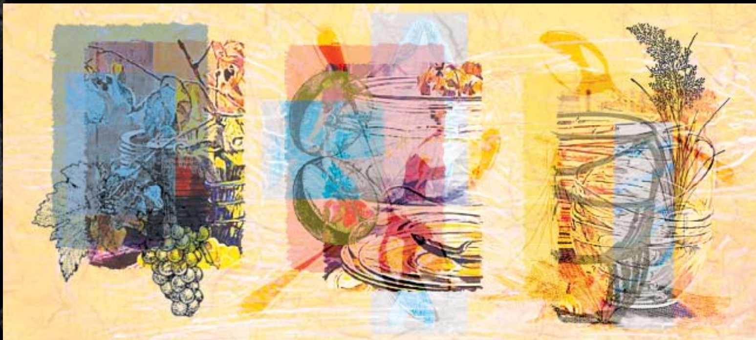
"STACKED" digital print 2009

217 840-4494 lkczys@gmail.com www.iwu.edu/~lczyz/portfolio/