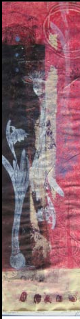
"ID" monoprint 2009

217 840-4494 lkcys@gmail.com www.iwu.edu/~lczys/portfolio/