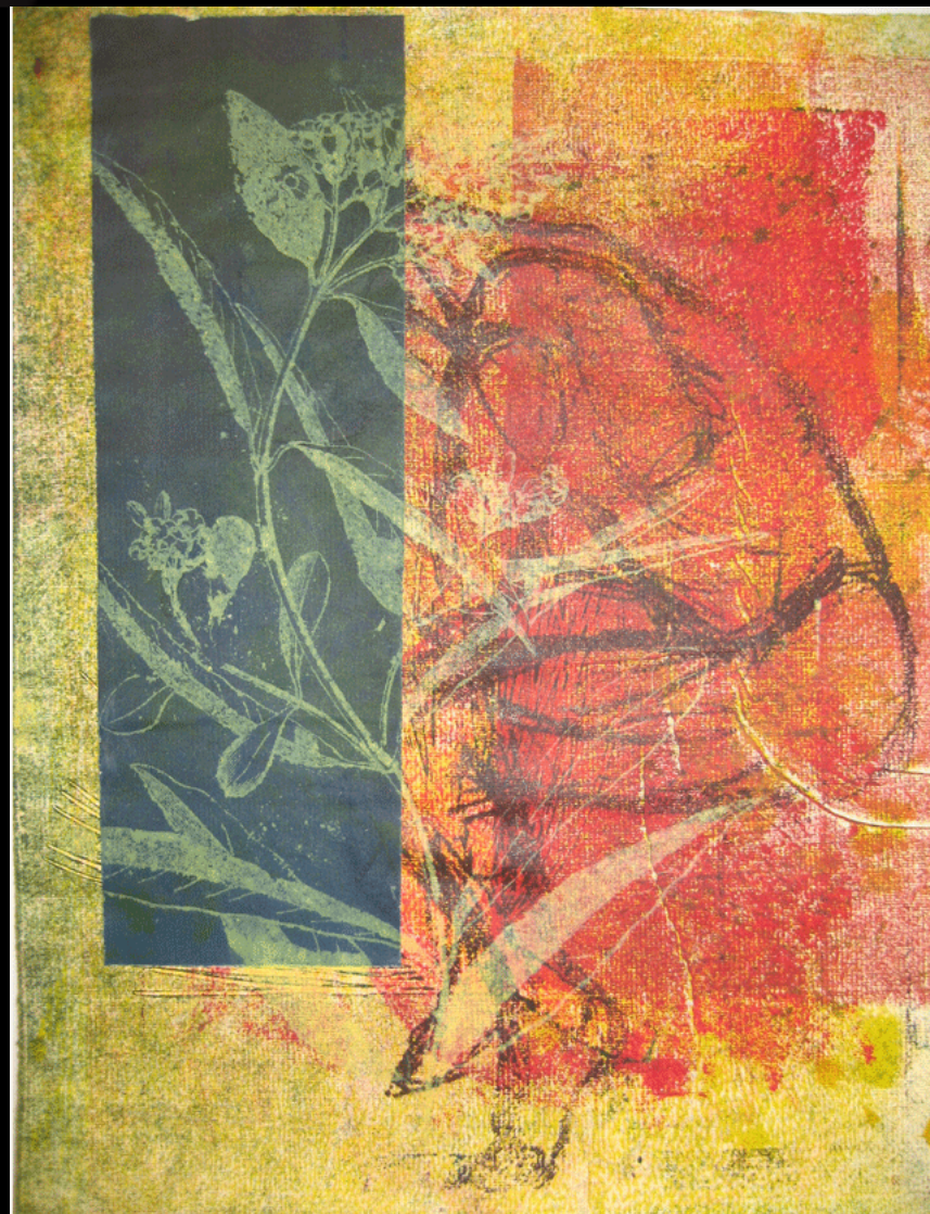
"THINK" monoprint 2009

217 840-4494 lkcys@gmail.com www.iwu.edu/~lczys/portfolio/