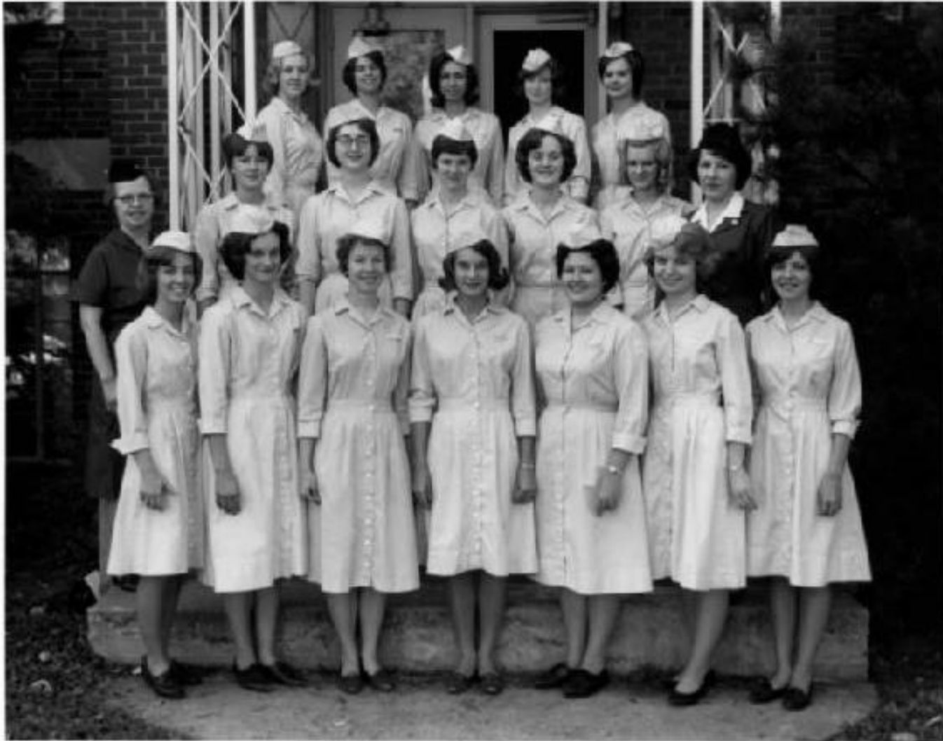
Class of 1965