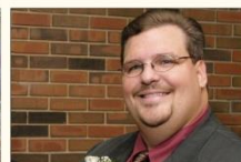
Brokaw Hospital School of Nursing Alums Celebrating 100 years of Brokaw Hospital School of Nursing Graduates and Brokaw/IWU alumni, 1902-2002