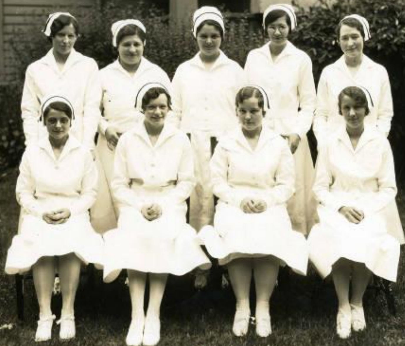
Graduating Class Brokaw Hospt June 1931