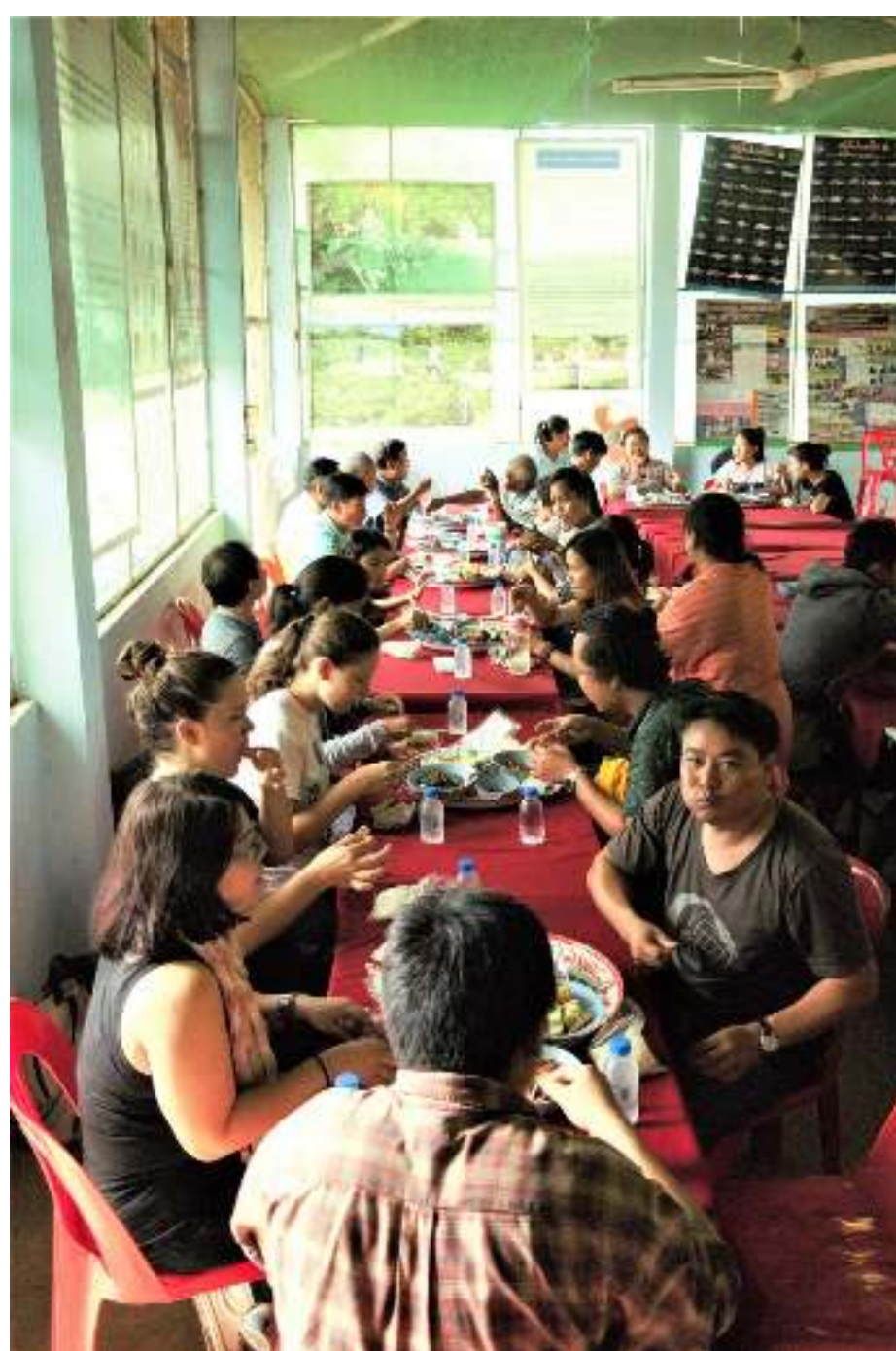
Learned about Local Culture