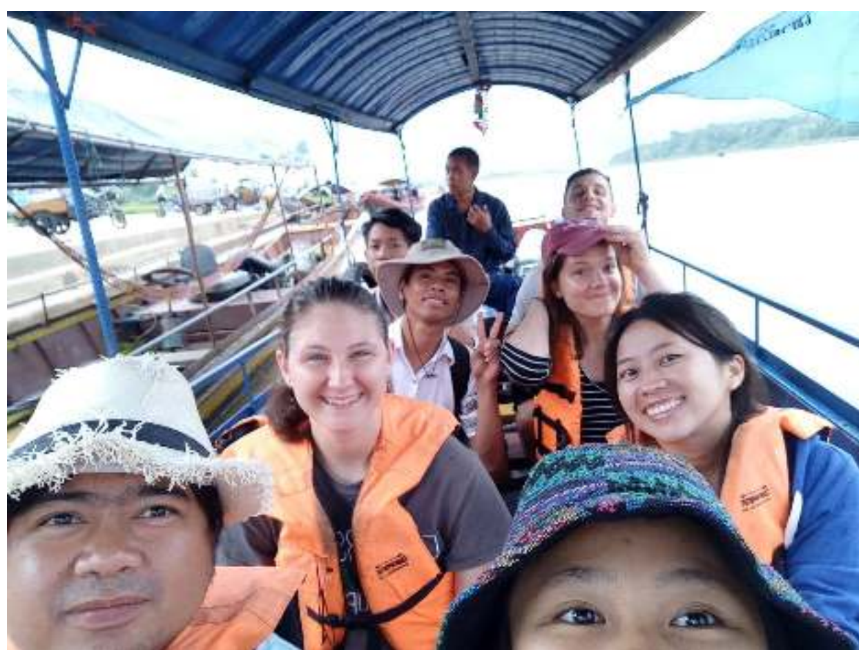
Took Many Boat Rides