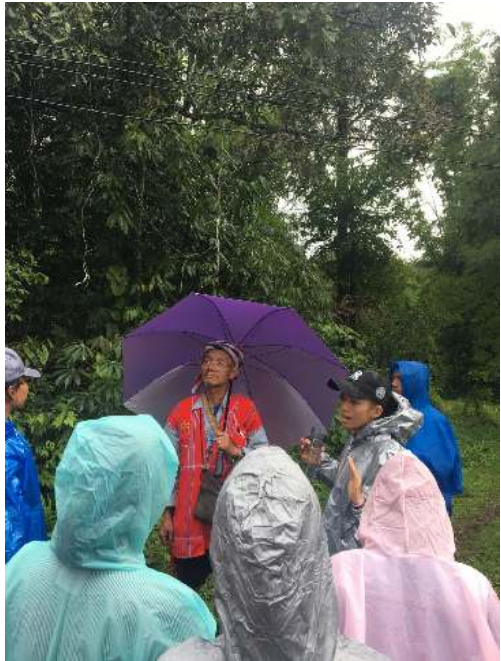
Met with Environmental Advocates in Different Villages