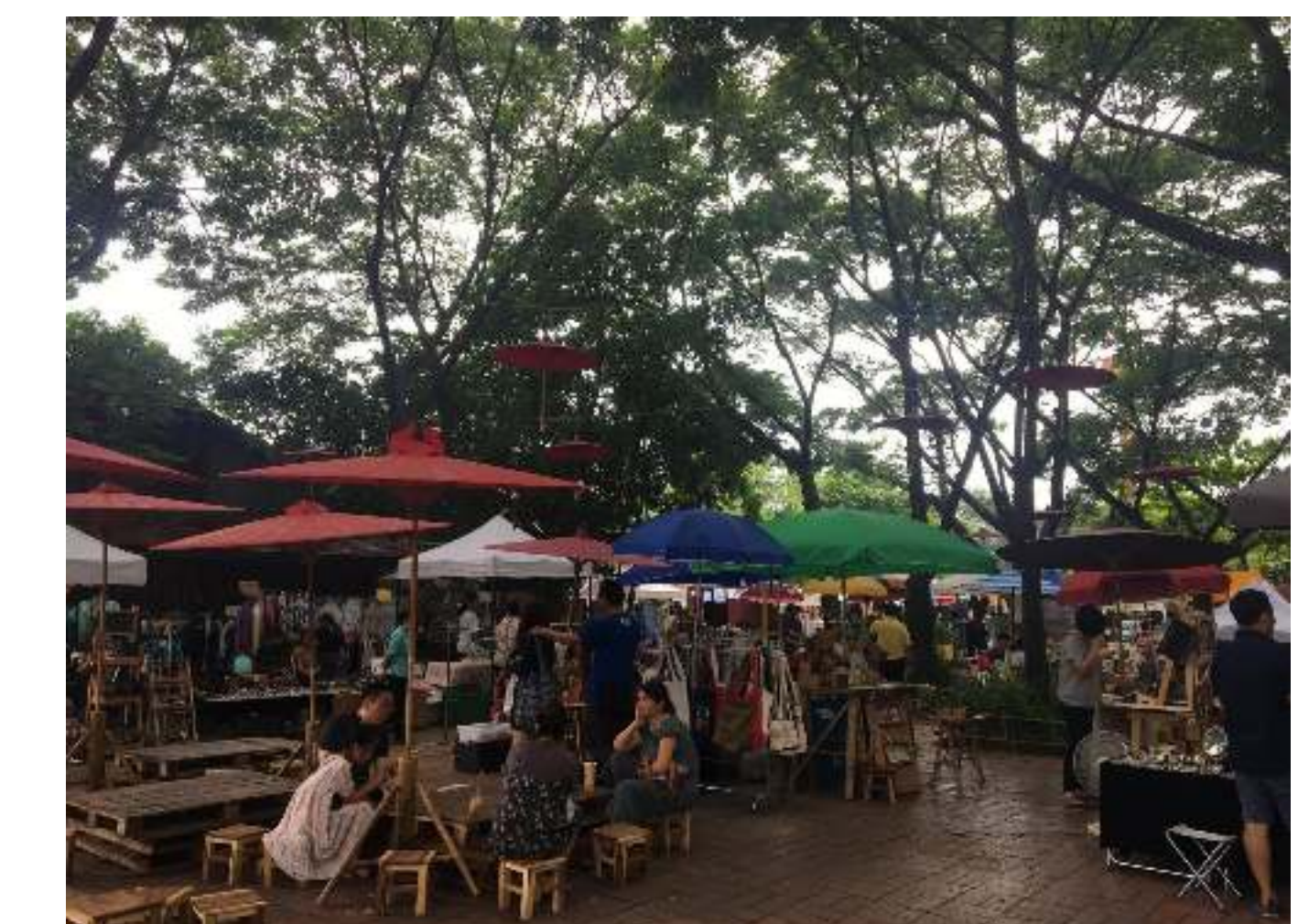
Tasted the Local Foods at Many Markets