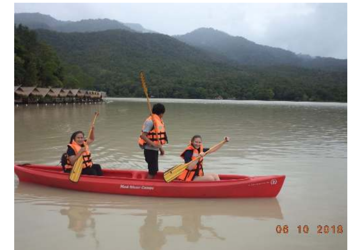
Canoed at Huay Tung Tao Lake