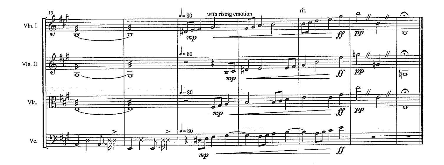
IV. The Storm