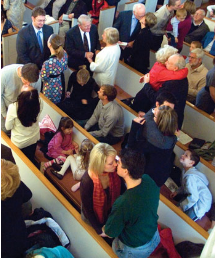
Several generations of alumni couples exchanged vows during a special Homecoming ceremony held in October.