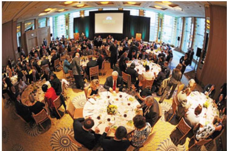
The Chicago gala was held in the grand ballroom of the Peninsula Hotel. Both the Chicago and campus events included screenings of videos about the campaign, which can be viewed at www.iwu.edu/campaign .