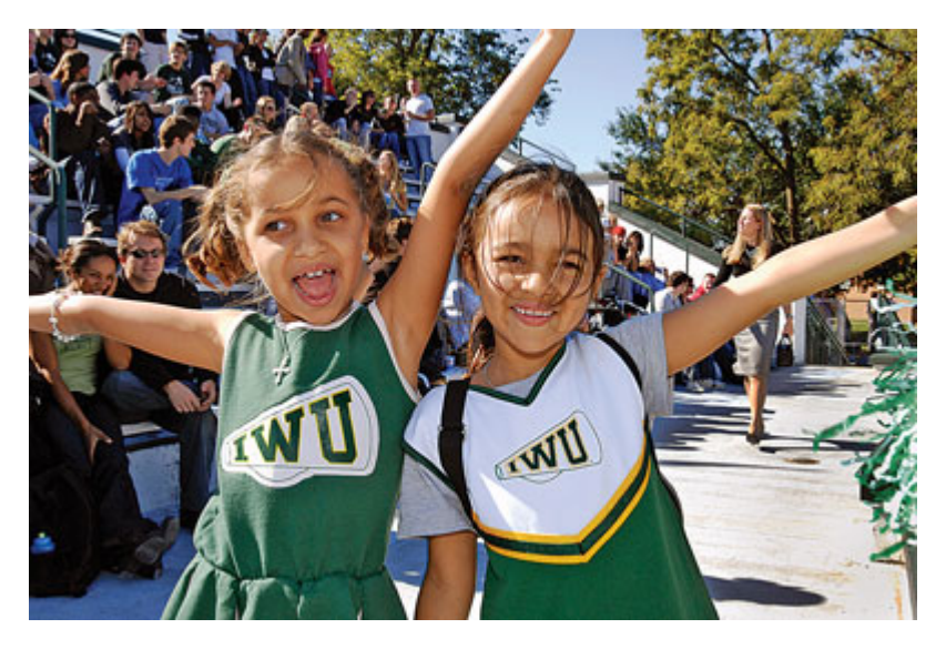
This pair of future Titans helped their parents cheer on the team at the football game.