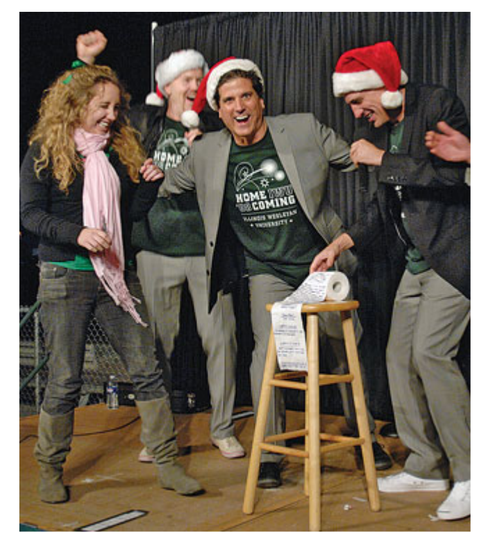
The Blanks, a vocal group featured on the TV show "Scrubs," recruited students into their act during the Titanium Pep Rally.