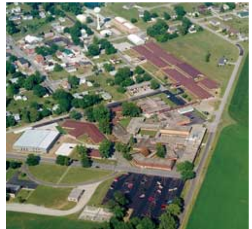
Hopedale residents agree that the medical complex is one of the biggest things to ever happen to the town. (Above) An aerial view shows how dramatically the complex has grown over 50 years.