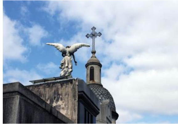
Madi Vukich '17

Snowdonia, Wales | Moelwyn Mountain Stream | Road Less Traveled / People's Choice winner