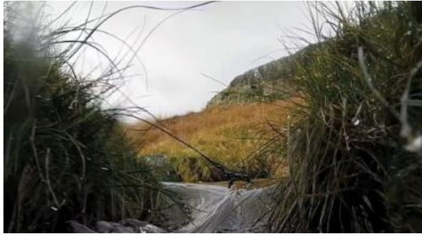
Zoe Bouras '18

Snowdonia, Wales | Moelwyn Mountain Stream | Road Less Traveled / People's Choice winner