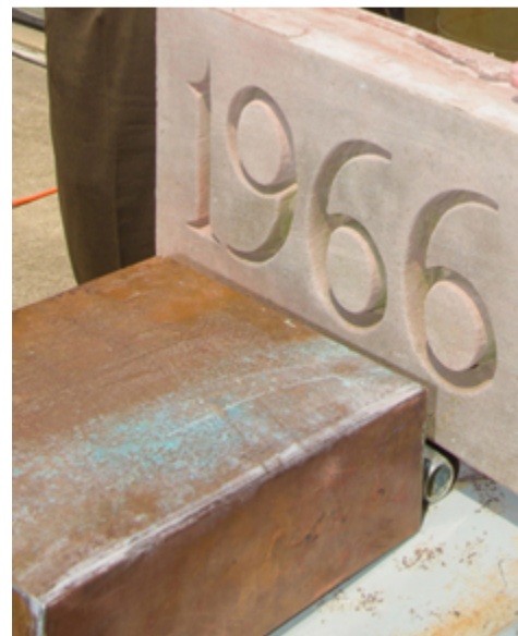
A ceremony on Saturday will reveal the contents of the old Sheean Library time capsule.