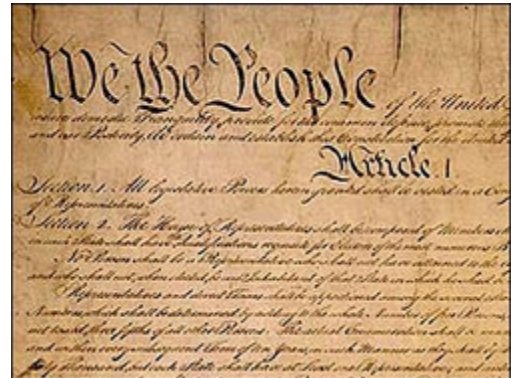
Government works like the Constitution remain in the public domain.

Copyrights can cover anything from the text of the novel The Girl with the Dragon Tattoo to a painting by Kandinsky or a song from a Broadway musical. Use or reproduction of a copyrighted item without permission of the owner is illegal. Copyrights generally lapse 70 years after death of the creator, according to the U.S. Copyright Office. Once the copyright expires, the work enters what is called "public domain," meaning anyone can reproduce the work without seeking permission.