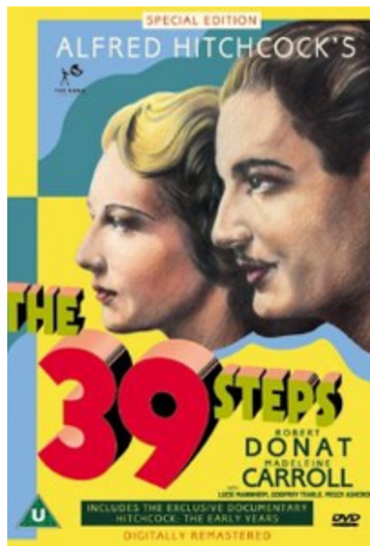
Alfred Hitchcock's movie 39 Steps is now in public domain.