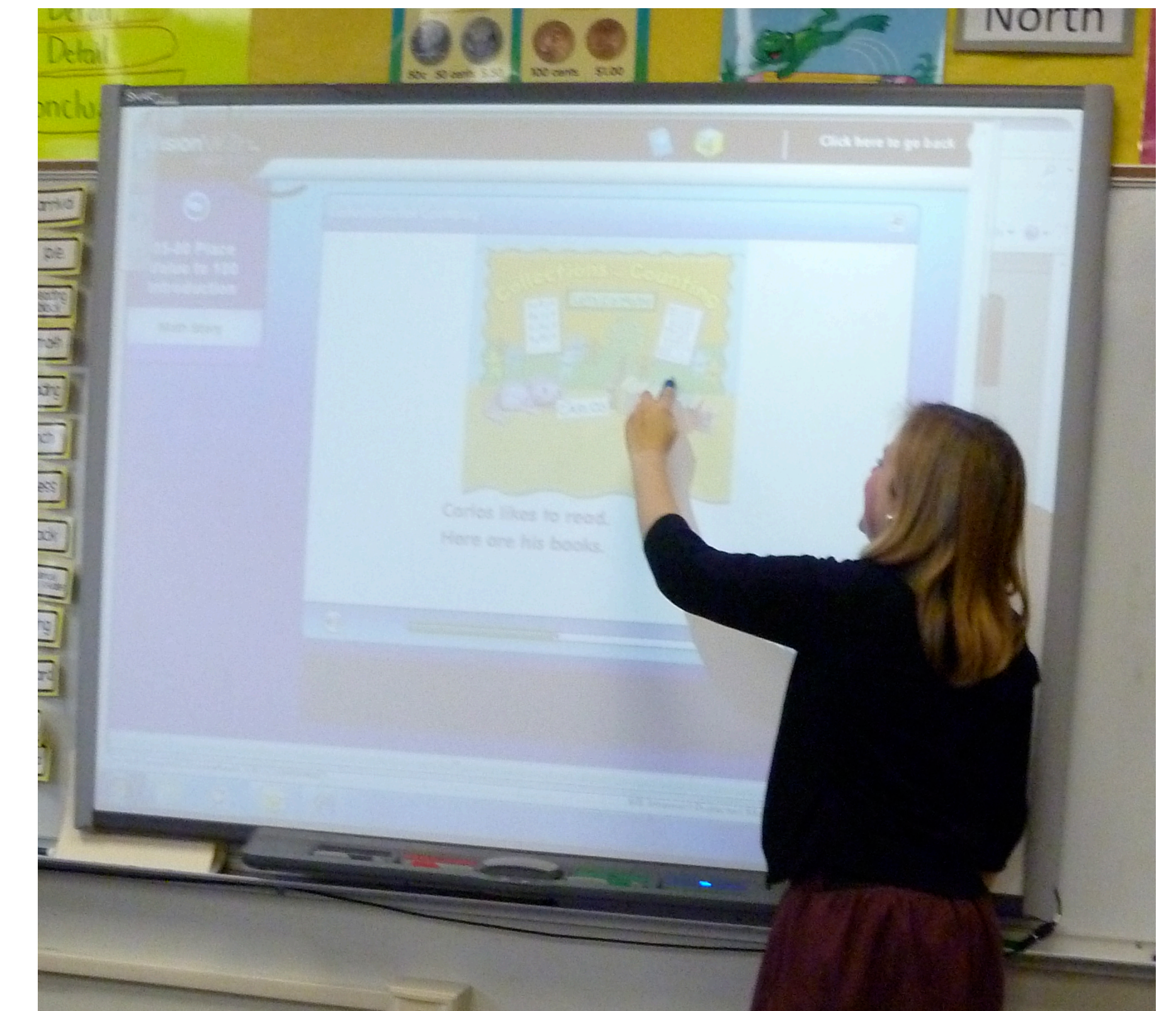
Figure 2. Using an interactive whiteboard to teach tens and ones through an interactive story.