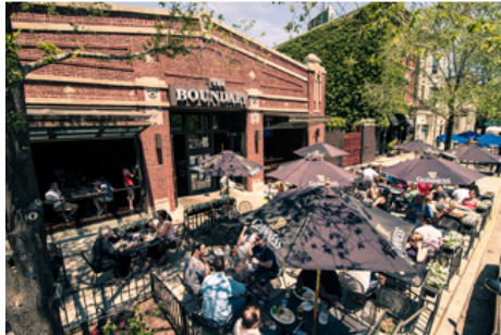
Outdoor seating at The Boundary is a popular feature shared by many Bottleneck venues.