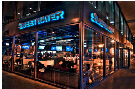
Among the friends' successful ventures is Sweetwater, opened in 2009 at a former Bennigan's on Michigan Avenue.

What Akemann, Bisaillon and Hilding do have is an uncanny instinct for creating high-energy, approachable restaurants in dynamic locations with upscale-style food and service at affordable prices. It's a recipe for success that has Bottleneck's restaurants flourishing during a time when many Americans have cut back on dining out.