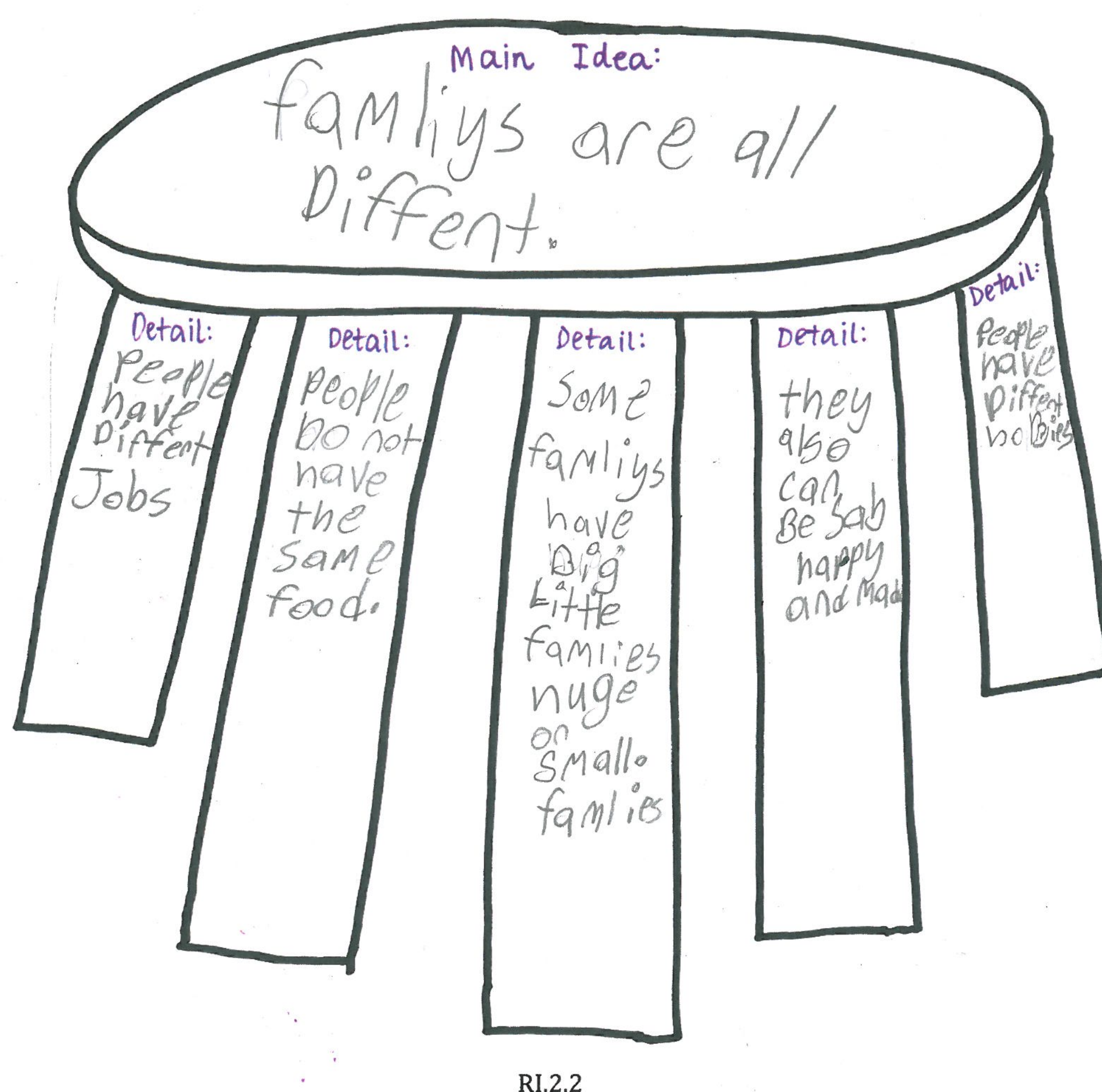
Figure 2: Student Work Example

Informational text picture books with social justice themes were utilized in each lesson.