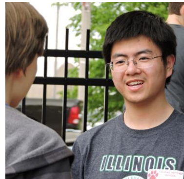
Chinese students volunteered to help local middle schoolers practice their Mandarin-language skills. Other IWU students used their skills in Italian, English and Spanish during community volunteering experiences.