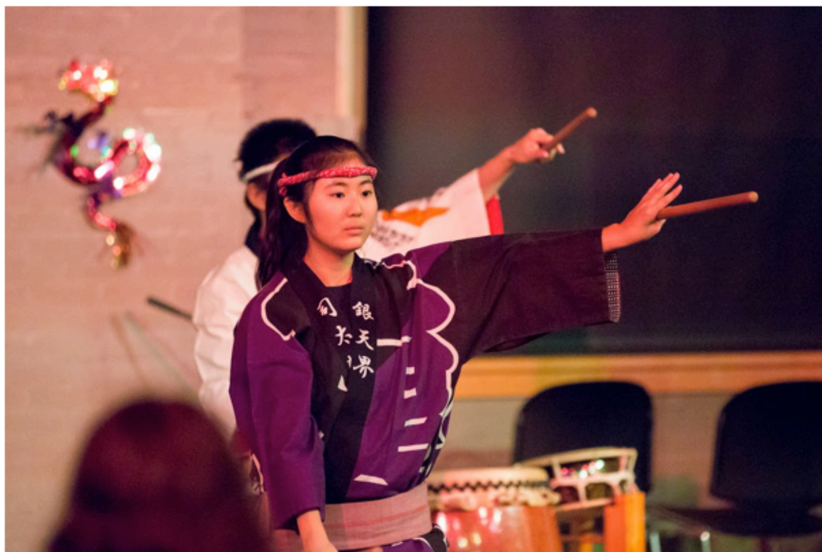
The Japanese drum ensemble Tsukasa Taiko Legacy performed at the Lunar New Celebration, allowing international students and friends to celebrate the Year of the Monkey.