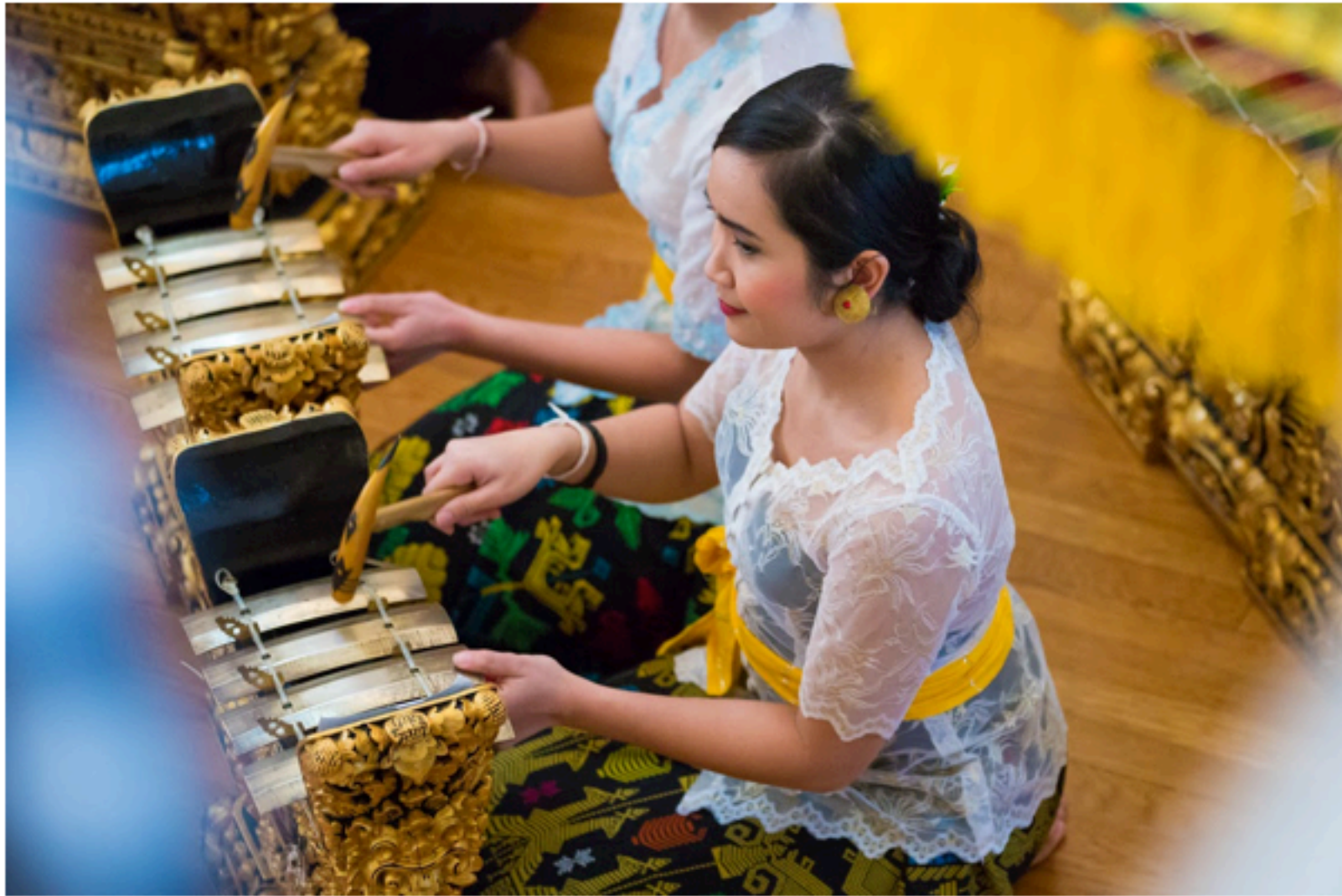
An Odalan Celebration of music and dance honored the Balinese Odalan celebration, a traditional Hindu temple re-dedication ceremony. The event was part of Evelyn Chapel’s “Religion, Music, and the Humanities” series.