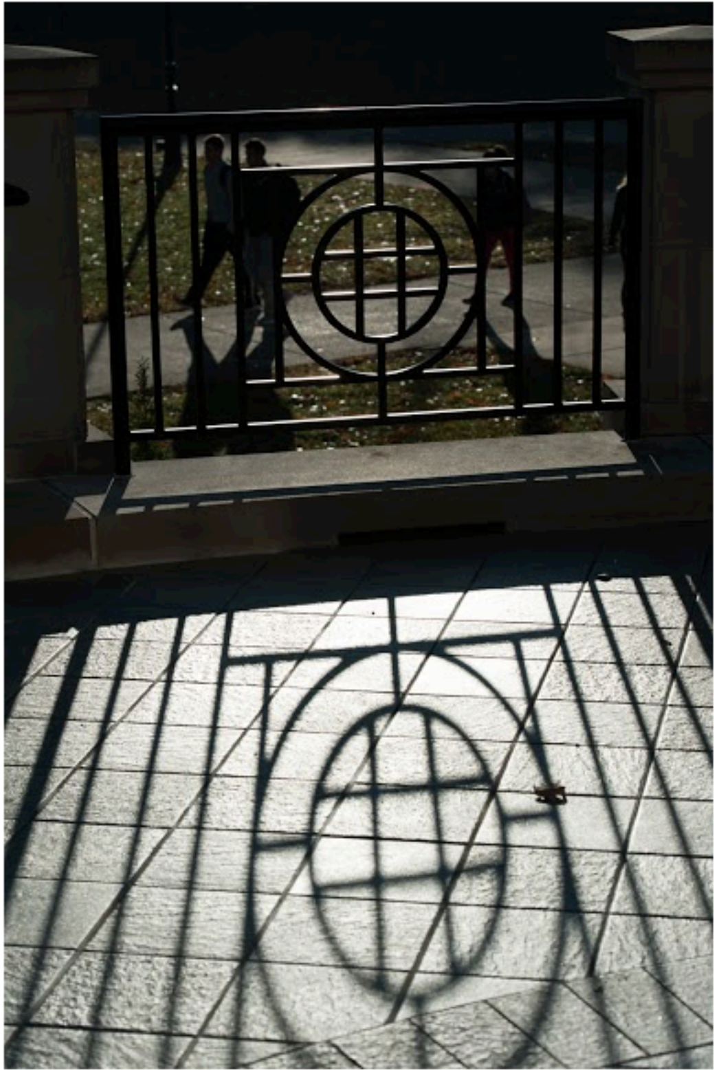
The winter sun makes shadow magic.