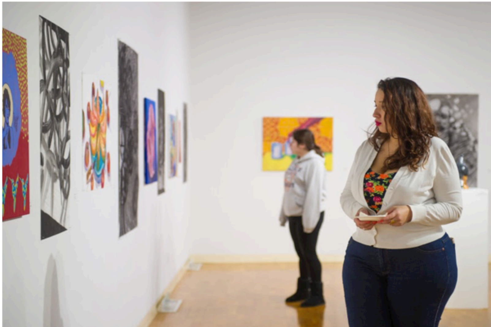
A patron peruses works in the Merwin Gallery at the opening of the 30th annual Student Juried Art Exhibition.