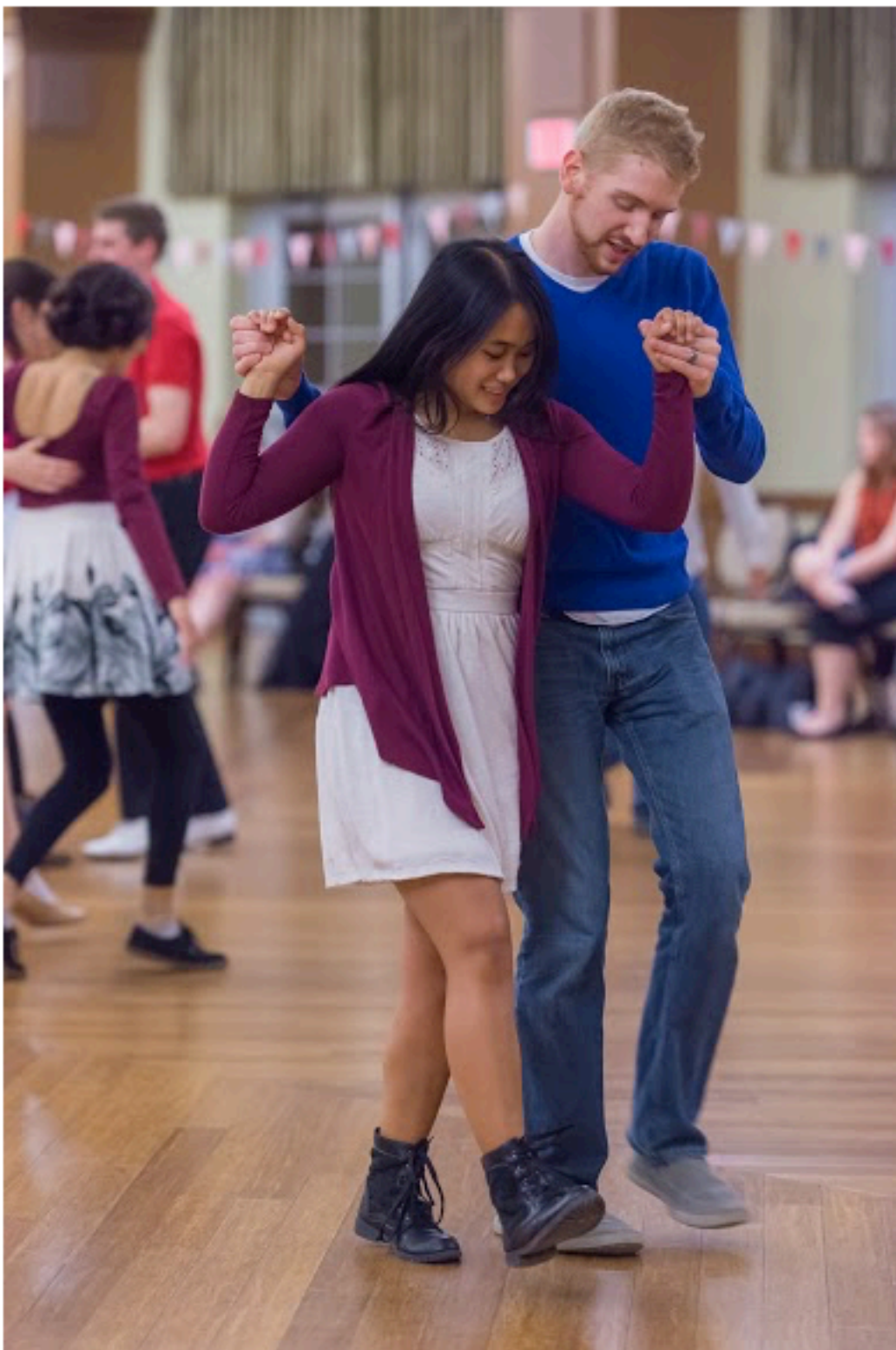
The Swing Dance registered student organization sponsored a Valentine’s dance for students, guests and all those who love the Lindy Hop.