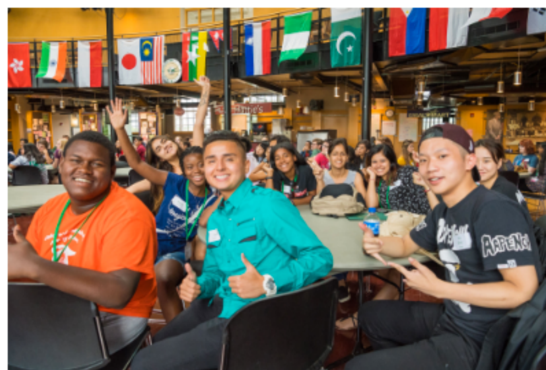
New students got to know each other at Pre-Orientation activities.