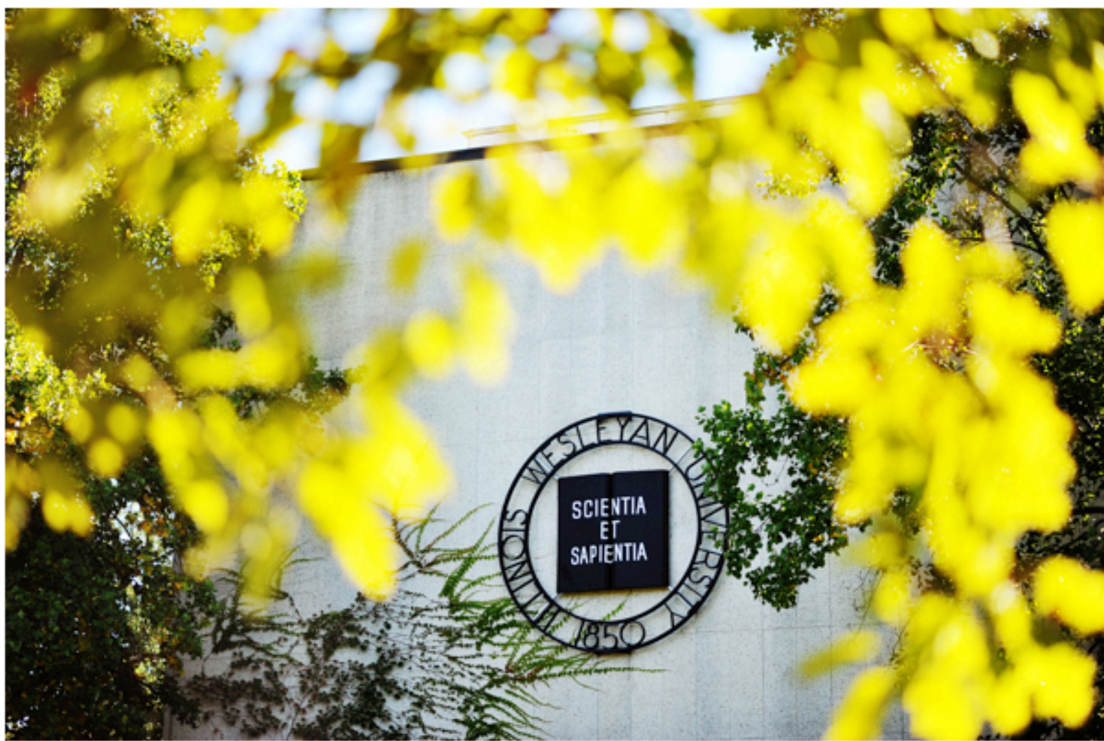
The strength of “Knowledge and Wisdom” – framed by the tranquility of nature’s beauty.