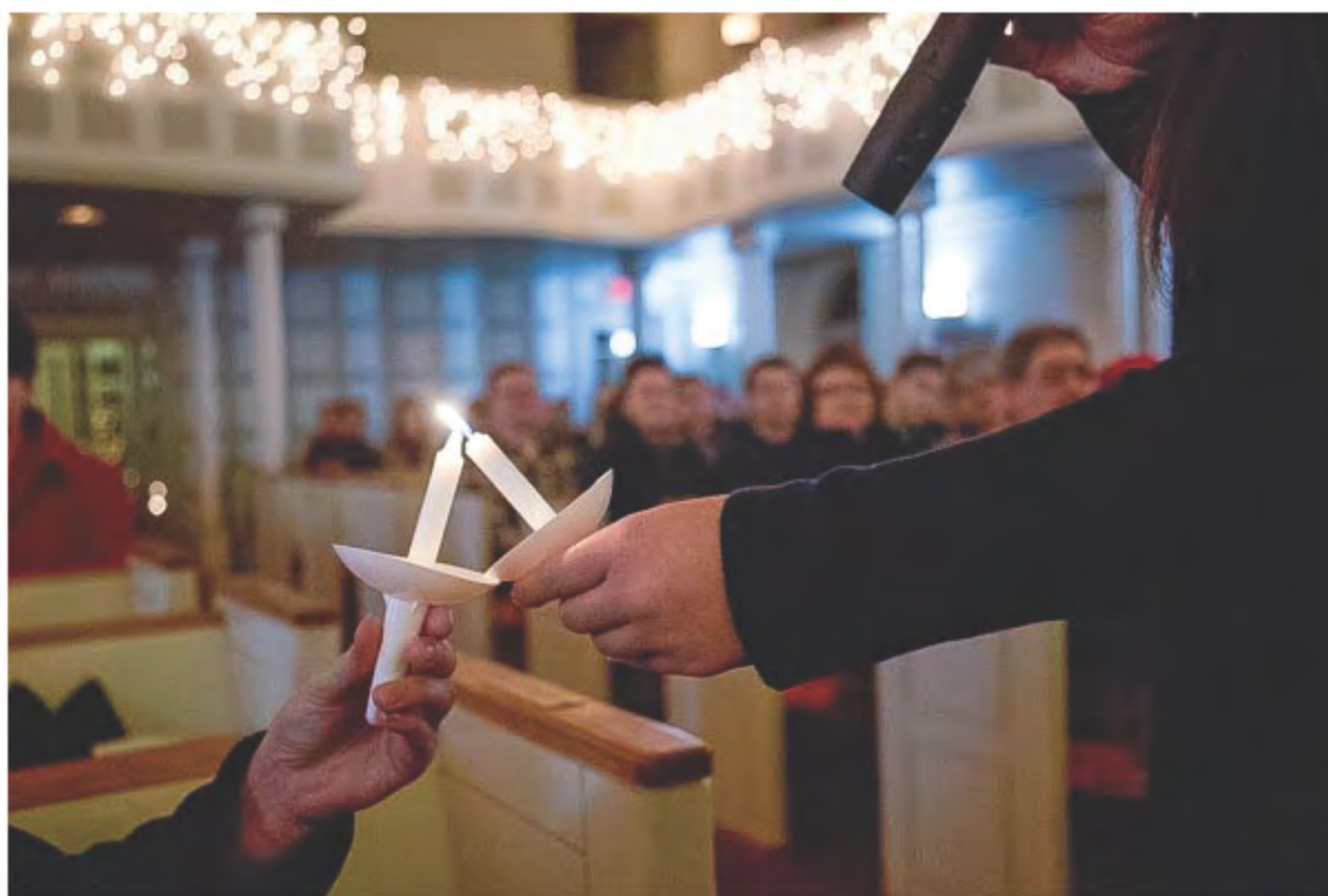
Students, faculty, staff and community guests gathered in Evelyn Chapel to let their lights shine in celebration of the season during the annual "Light the Night" multicultural event.