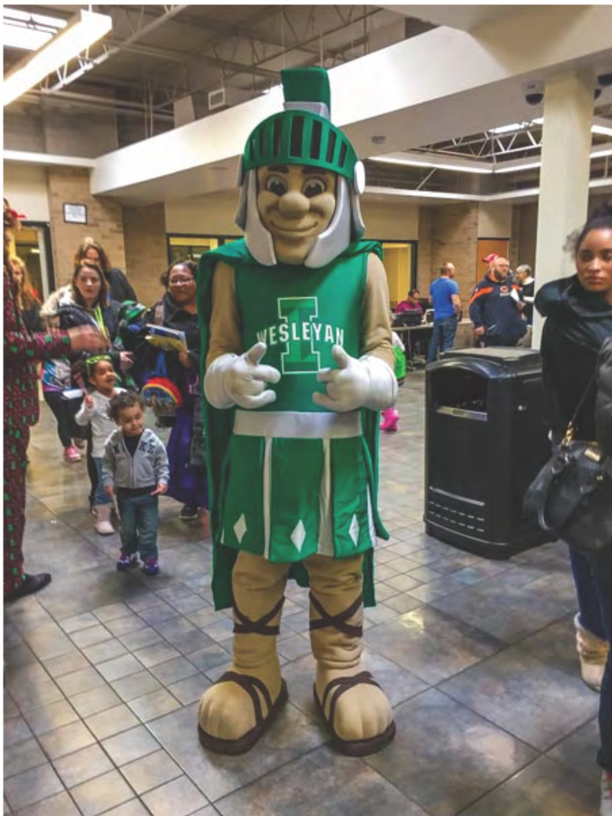
Spreading enough holiday joy this month to rival Santa Claus, Tommy Titan made an appearance at the Children's Christmas Party sponsored by the Bloomington & Normal Labor & Trades Assembly and the McLean County Chamber of Commerce.