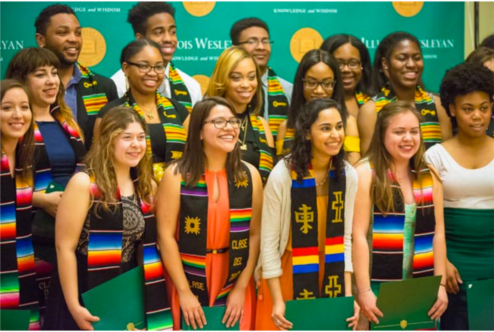
Several members of the Class of 2017 pose for photos following Multicultural Graduation. The annual event celebrates the accomplishments of Multiracial, African-American, Latino-Hispanic, Asian-American and Native American graduates. The stoles, which the seniors will also wear at Commencement, represent a student’s heritage.