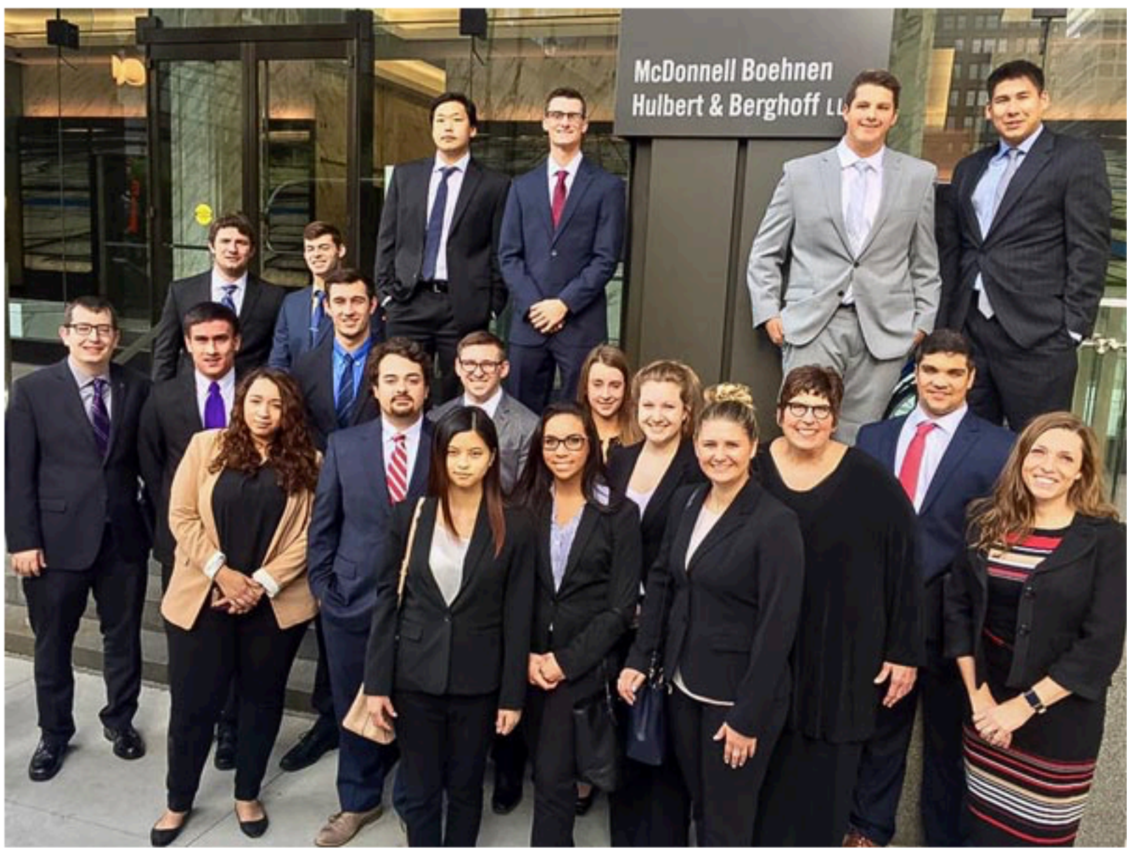
Students enrolled in the May Term course “Marketing Seminar: Entrepreneurship” visited eight business sites, including the law offices of McDonnell Boehnen Hulbert & Berghoff, during a three-day trip to Chicago. Other sites included Google Chicago, Fruition Partners, CannonDesign, mHUB and other locations where students heard presentations from more than 20 alumni entrepreneurs and senior leaders at their companies.