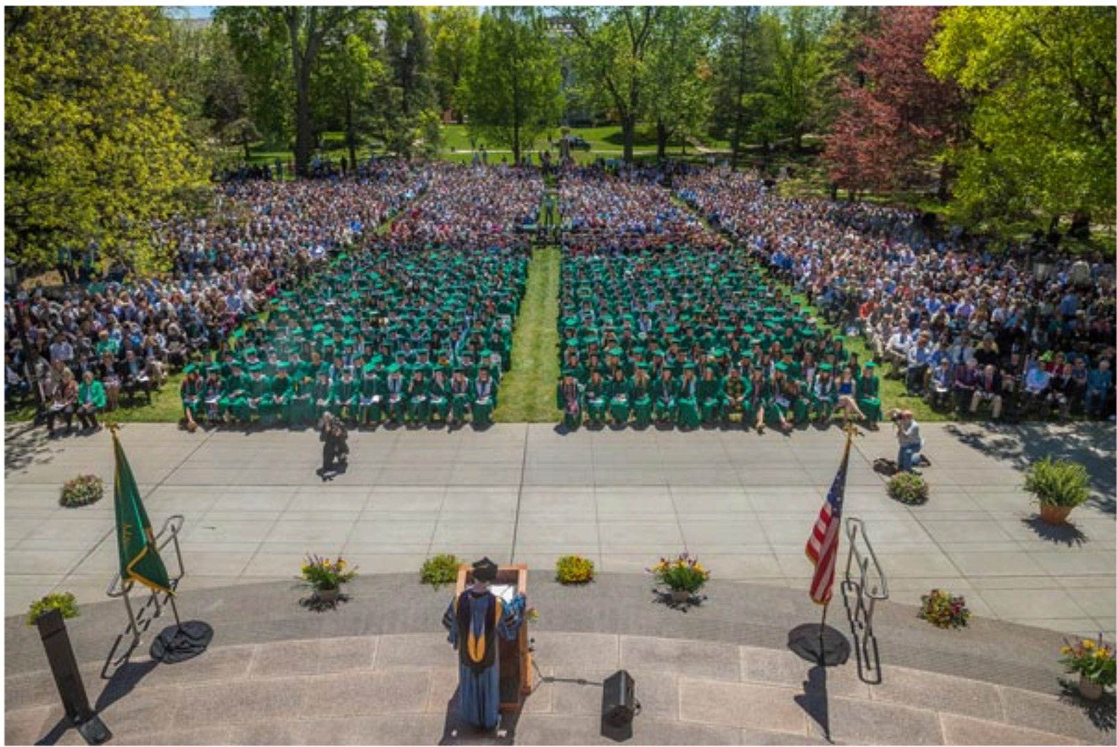
Mother Nature delivered a gorgeous day for the University’s Commencement on May 7.