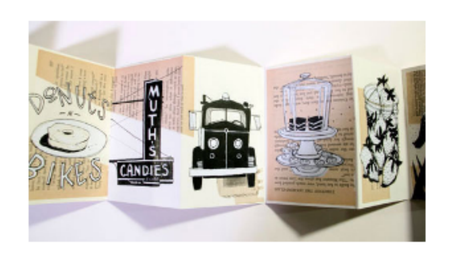
Sketchbook by Meena Khalili