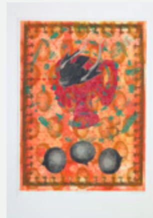
Constance Estep Behind the Hedges