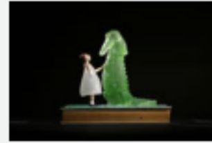
Carmen Lozar Crocodile Tears