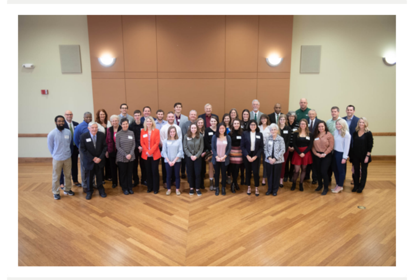
IWU State Farm Scholars were recognized during the annual State Farm Scholars Luncheon.