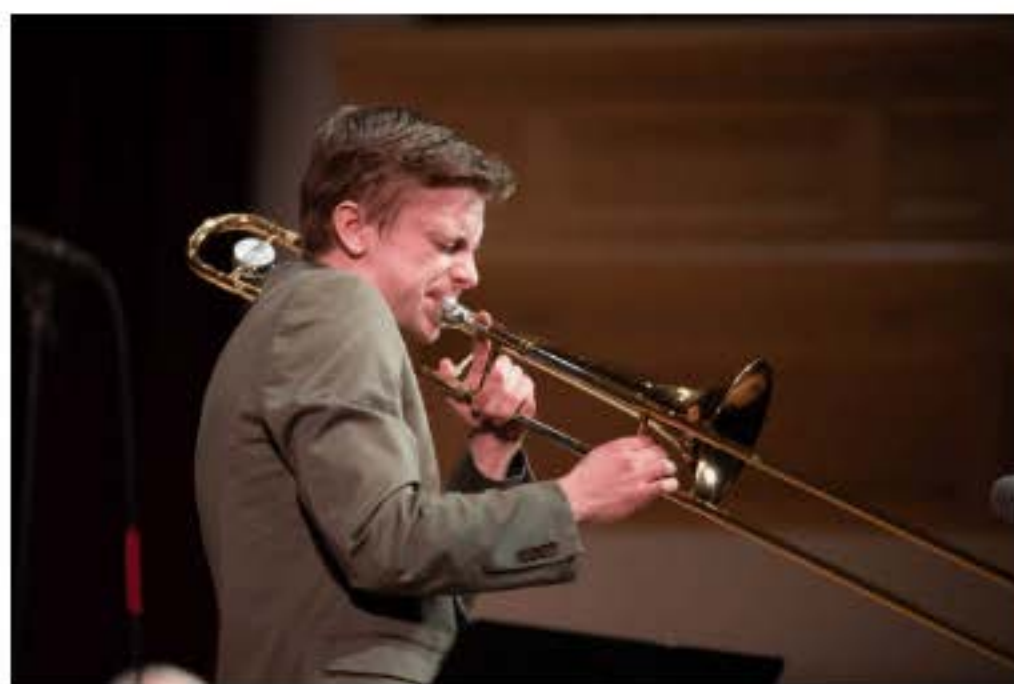
A trombone player performs at a previous Jazz Festival.