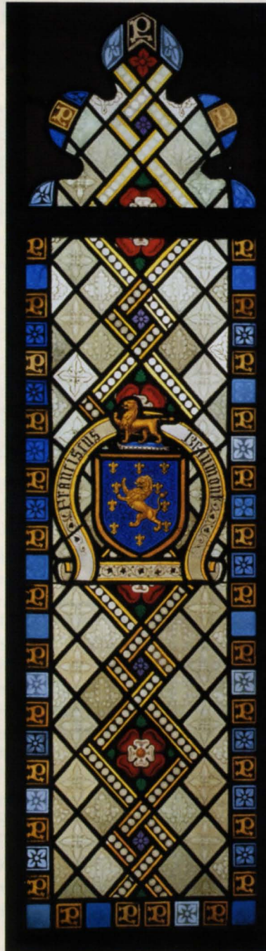
Restored window honoring playwright Francis Beaumont (1584-1616).